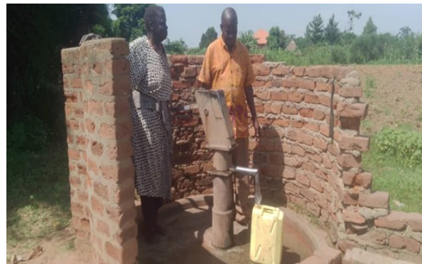
Repaired borehole restored through community-led advocacy efforts

Faced with mounting pressure and an increasingly informed and vocal community, the sub-county leadership responded swiftly. Within days of the meeting, the long-abandoned borehole was finally repaired at a cost of UGX 370,000 in April 2025, restoring access to safe drinking water for over 500 residents of Omong village, Akuoro Parish in