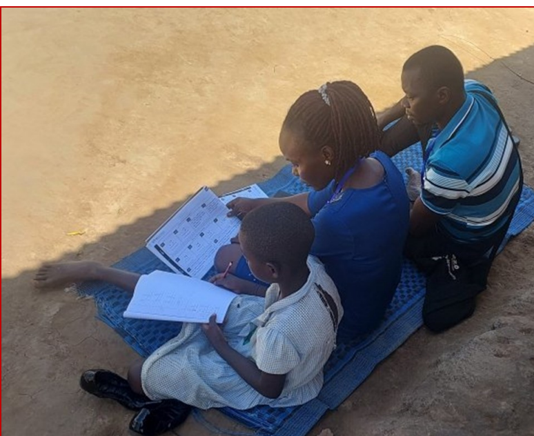
Children participating in the ICAN/ICARe pilot assessment in Budaka District

In the related development and as part of ongoing shared efforts to promote evidence-based education policy advocacy, Citizen Initiative for Democracy and Development – Uganda (CIDD-UG), in collaboration with Uwezo Uganda, successfully conducted a pilot phase of the International Common Assessment on Numeracy and Reading (ICAN/ICARe) in Budaka District. The community-led assessment formed part of a broader initiative spearheaded by the People's Action for Learning (PAL) Network, implemented across 14 countries in the Global South, including Uganda. The pilot targeted children aged 5 to 16 years and aimed to generate reliable, comparable data on foundational learning outcomes in numeracy and reading . The findings from the ICAN/ICARe assessment are intended to inform a wide range of stakeholders including parents, teachers, local leaders, and