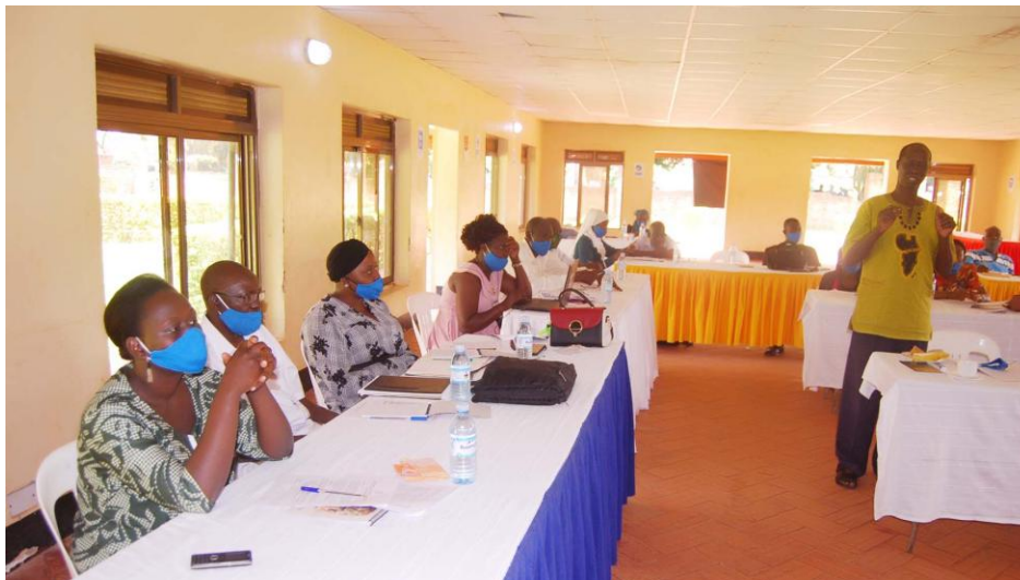
Participants during Regional Electoral Stakeholder Engagements Dialogue at Country Inn Hotel – Pallisa

Whereas we reached over 1000 listeners through a radio talk show, the